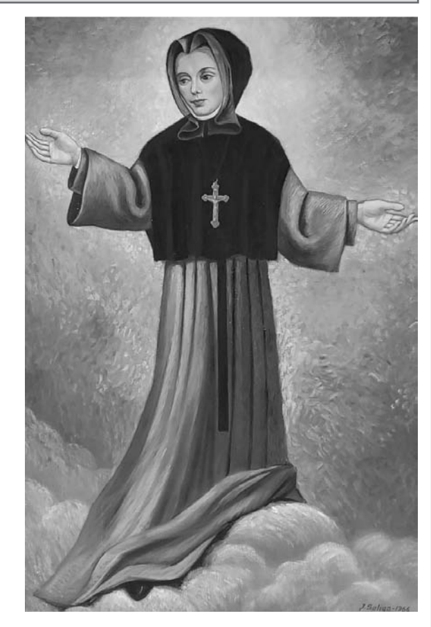
"Providence is wonderful, it has means we cannot understand to relieve those who put their trust in it, it provides for everything, in it is my trust."