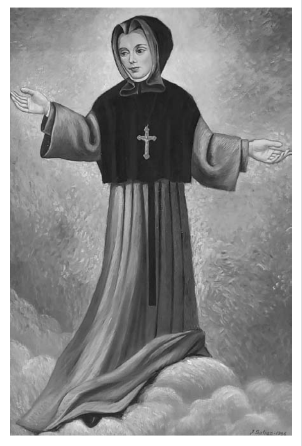
"Providence is wonderful, it has means we cannot understand to relieve those who put their trust in it, it provides for everything, in it is my trust."