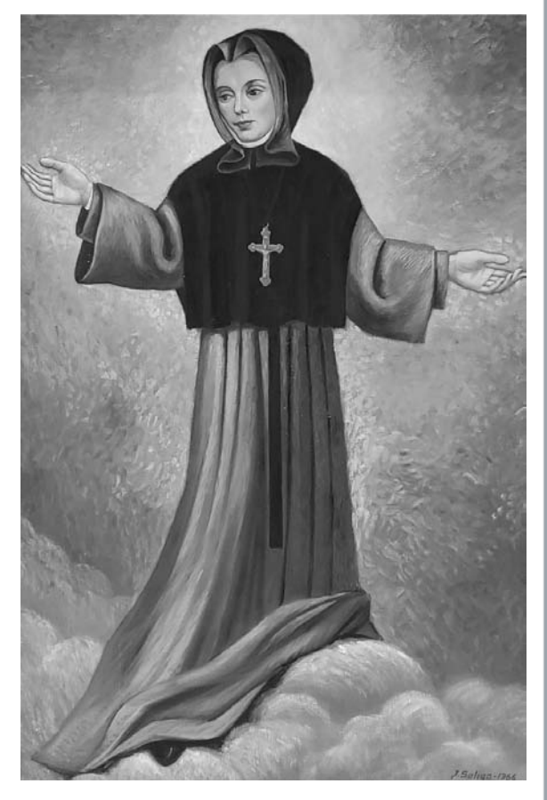
"Providence is wonderful, it has means we cannot understand to relieve those who put their trust in it, it provides for everything, in it is my trust."