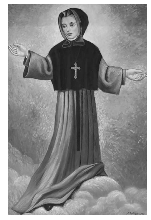
"Providence is wonderful, it has means we cannot understand to relieve those who put their trust in it, it provides for everything, in it is my trust."