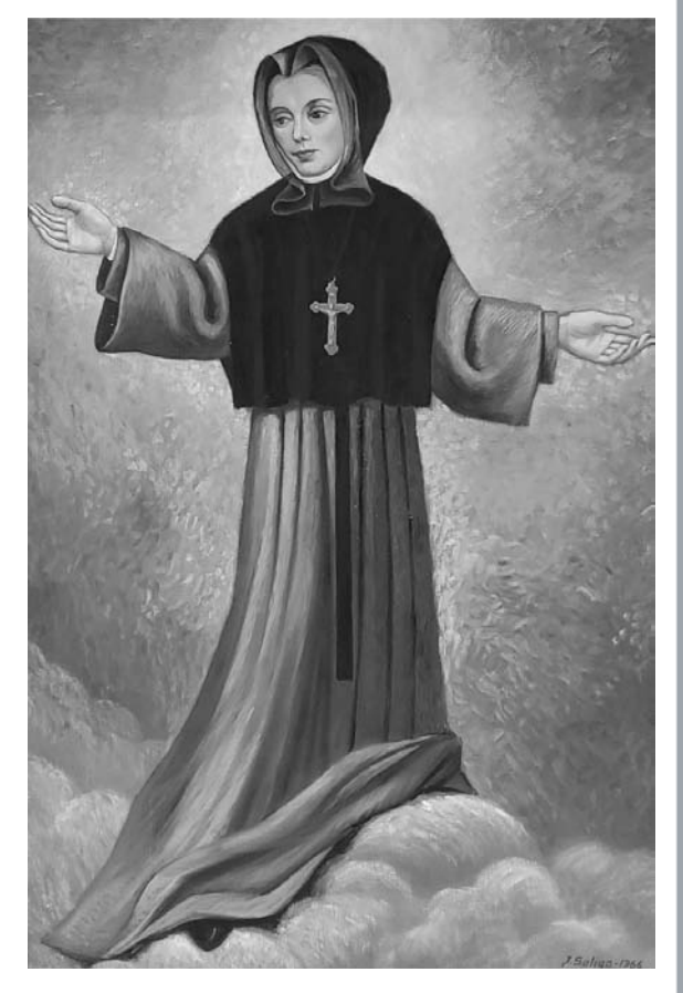
"Providence is wonderful, it has means we cannot understand to relieve those who put their trust in it, it provides for everything, in it is my trust."