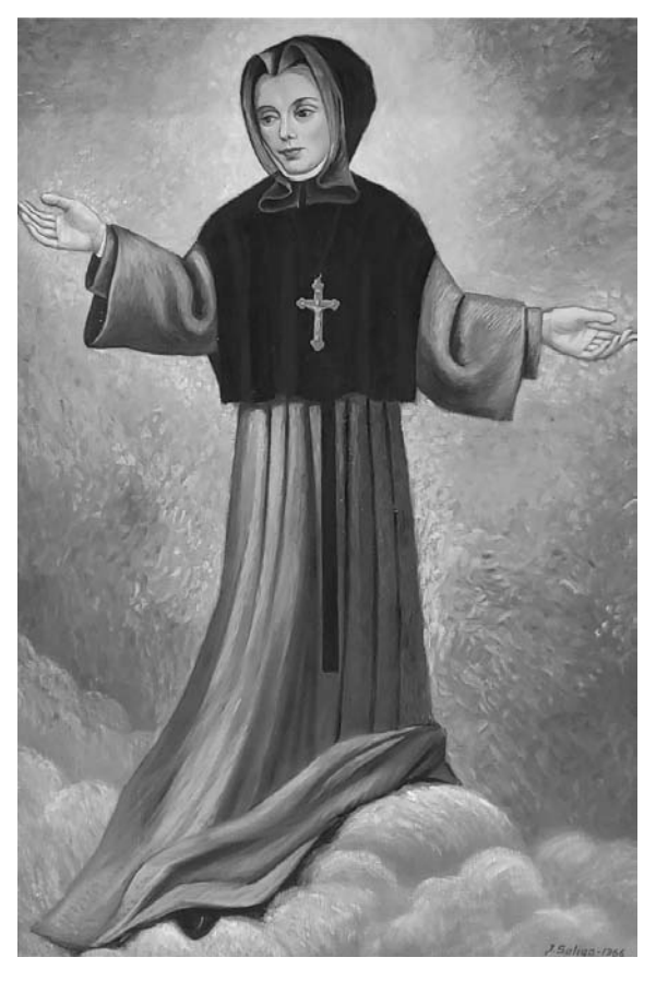
"Providence is wonderful, it has means we cannot understand to relieve those who put their trust in it, it provides for everything, in it is my trust."