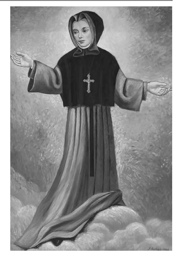
"Providence is wonderful, it has means we cannot understand to relieve those who put their trust in it, it provides for everything, in it is my trust."