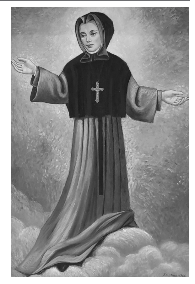
"Providence is wonderful, it has means we cannot understand to relieve those who put their trust in it, it provides for everything, in it is my trust."