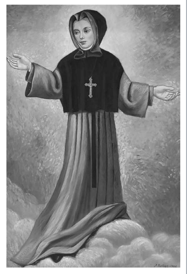
"Providence is wonderful, it has means we cannot understand to relieve those who put their trust in it, it provides for everything, in it is my trust."