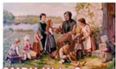
SMDY Kids Corner

Our new Online Children's Liturgy program is designed for all children and teaches the Liturgy of the Word in terms children can understand. During this time of COVID restrictions it has been hard for us to continue with the program and so we will be offering an online option to communicate with the parish's children. We have produced instructive videos for the children to view to help them on their Christian journey and can be accessed by clicking on the SMDY Kids Corner image on our website.