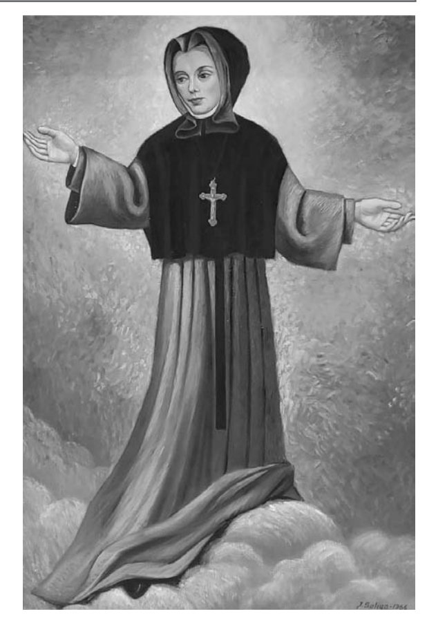
"Providence is wonderful, it has means we cannot understand to relieve those who put their trust in it, it provides for everything, in it is my trust."