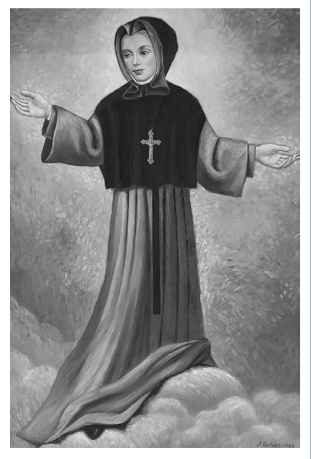
"Providence is wonderful, it has means we cannot understand to relieve those who put their trust in it, it provides for everything, in it is my trust."