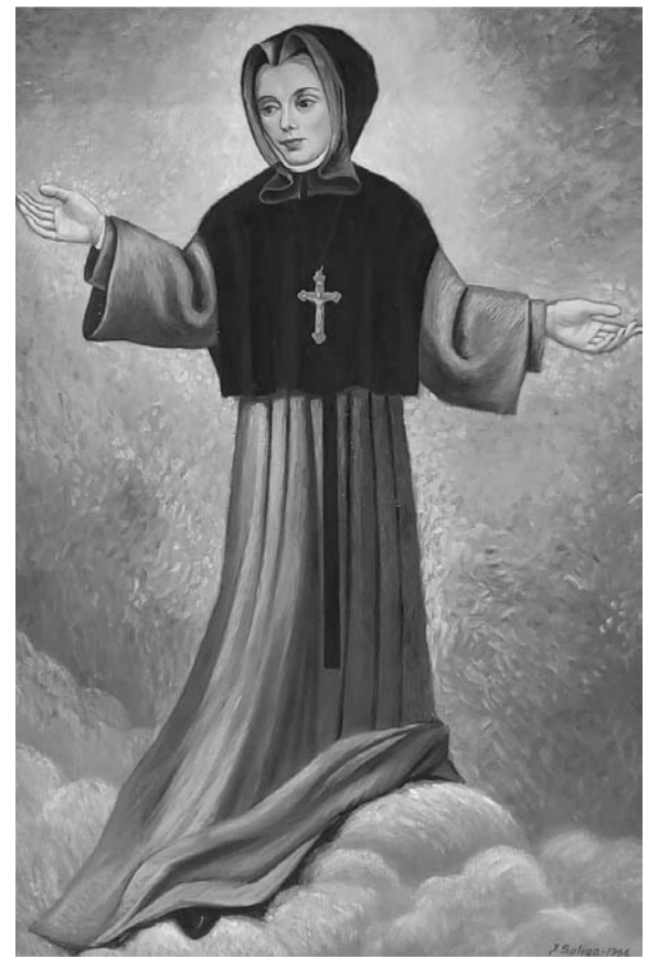
"Providence is wonderful, it has means we cannot understand to relieve those who put their trust in it, it provides for everything, in it is my trust."